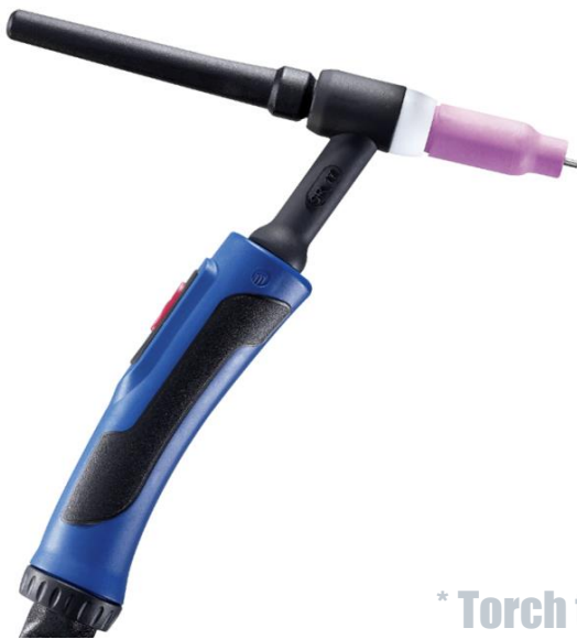
* Torch type